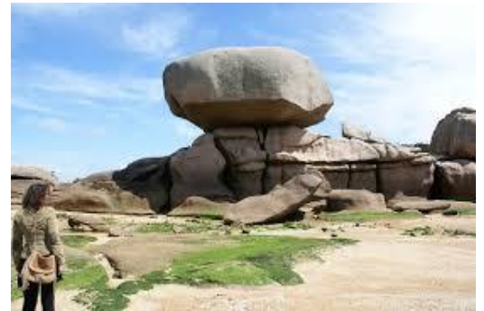
Les chaos granitiques